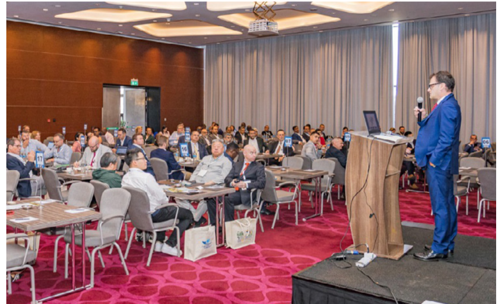
ALN and ALNA meeting - Nairobi, 2023